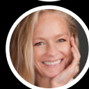
Suzy Amis Cameron Environmental advocate and author of The OMD Plan