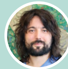
Tom Szaky Founder of TerraCycle