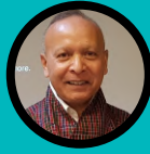
Thakur S. Powdyel Former Minister of Education of Bhutan