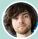
Boyan Slat Founder of The Ocean Cleanup